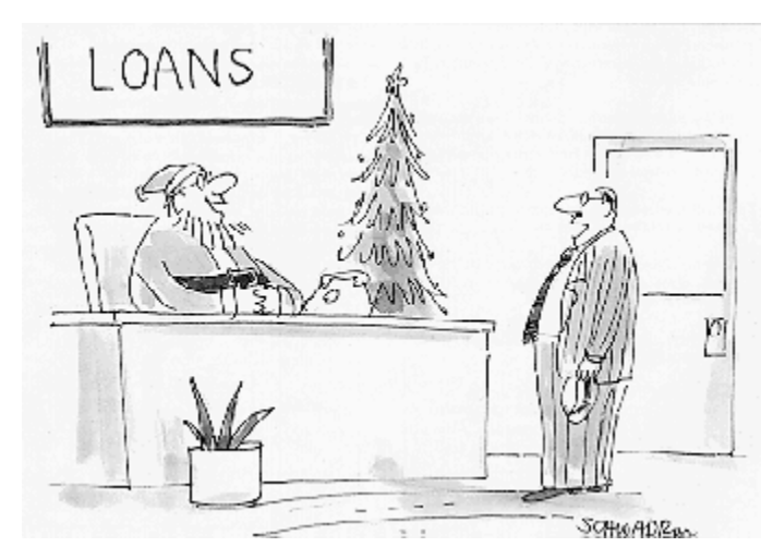
"Does 'ho, ho, ho' mean yes or no?"

between the open and closing price. The buy signal method described above states that a buy signal is generated when two intraday 600-plus downtick readings are recorded at approximately the level of the Diia. The next day, April 9, the market rallied, hitting 750 upticks intraday and closing up eight points on the June S&Ps. Even though high upticks were recorded, the market held its gain, so an impending top was not indicated (rule 1). In addition, at breakaways from tops or bottoms, the tick index will usually record high intraday tick readings exceeding 500 (rule 4).